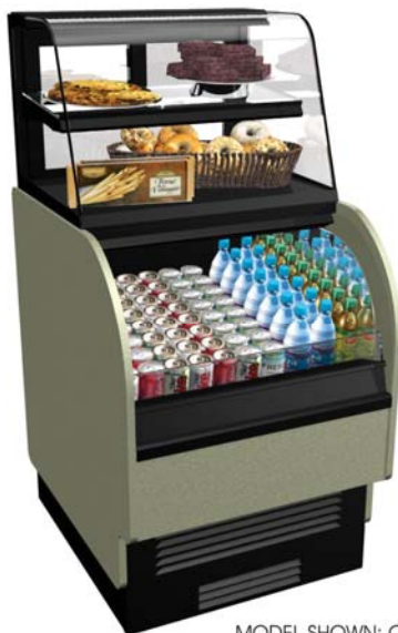
MODEL SHOWN: COU2757R

Lengths include end panels 27-1/2"L x 34-3/4"D x 57-7/8"H