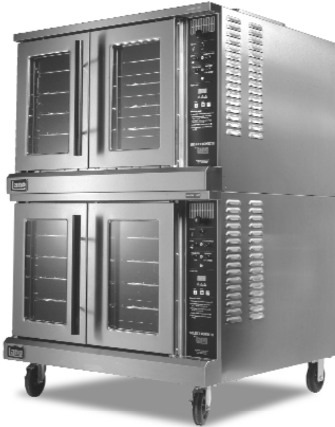
Model ECOF-AP2 shown