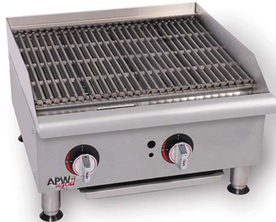
Model GCB-24i Gas Radiant CharBroiler